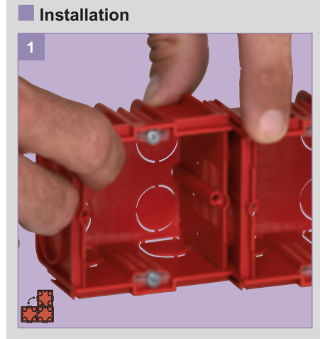
Horizontal or vertical joining of 1 gang boxes (Cat.No 0 801 41)