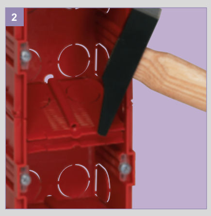
The sides can be removed before or after joining