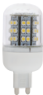
SAYA LED48 SMD G9